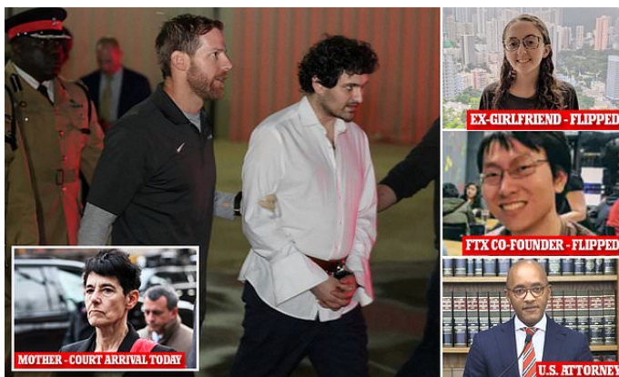
Mother of crypto 'crook' Sam Bankman-Fried walks into NYC court